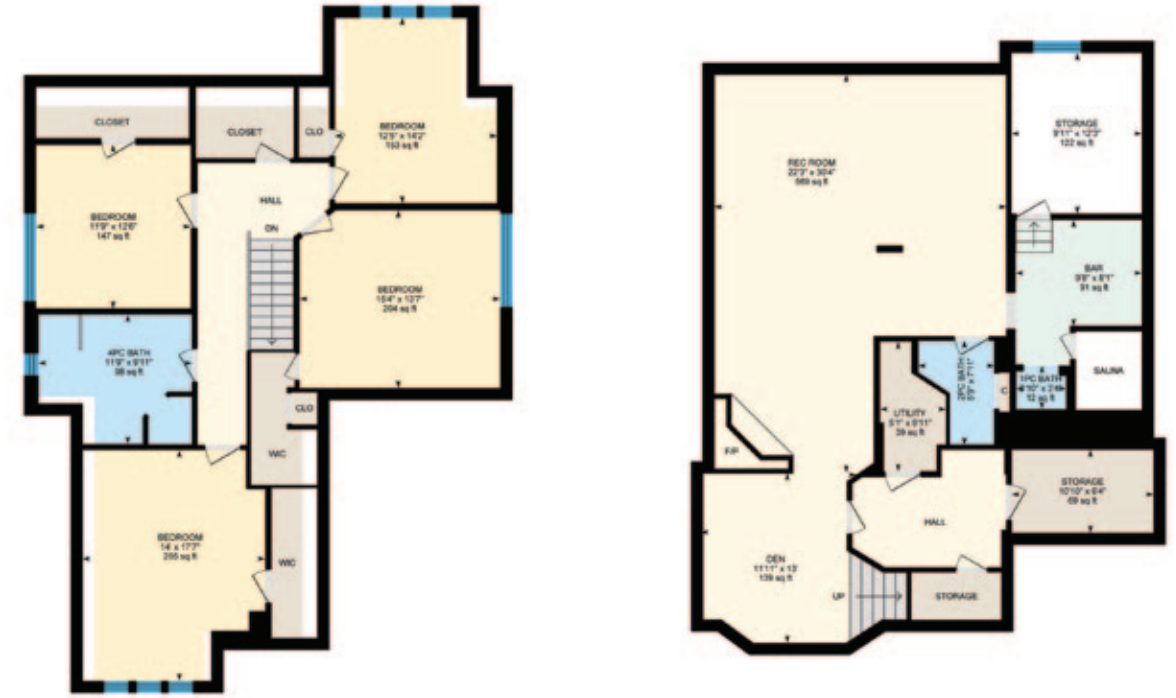
3rd Floor Exterior Area 1314.18 sq ft

Main Building: Total Exterior Area Above Grade 4597.24 sq ft