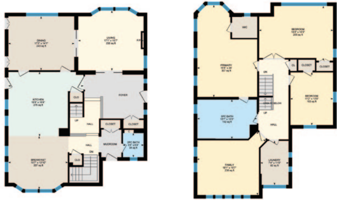
Main Floor Exterior Area 1639.52 sq ft

Main Building: Total Exterior Area Above Grade 4597.24 sq ft